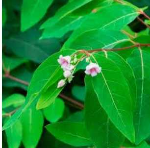
Dogbane, Spreading Apocynum androsaemifolium