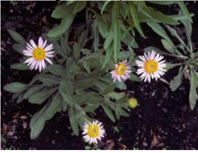
Fleabane, Tufted Erigeron caespitosus