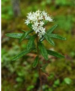
Labrador Tea, Common Ledum groenlandicum