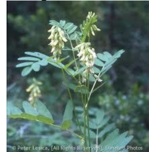
Milk Vetch, American Astragalus americanus