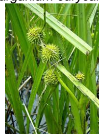
Bur-reed, Giant Sparganium eurycarpum