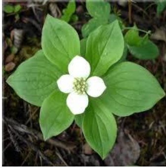
Bunchberry Cornus canadensis