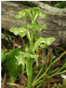
Orchid, Blunt-leaved Bog Platanthera obtusata