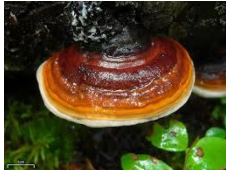
Red Belted Conk Fomitopsis pinicola