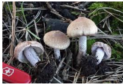
Lilac and Grey Inocybe Inocybe griseolilacina