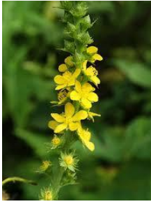
Agrimony Agrimonia striata