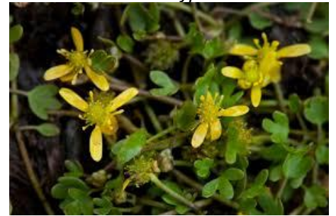
Buttercup, Arctic Ranunculus hyperboreas