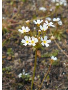
Candelabra, Northern Fairy Androsace septentrionalis