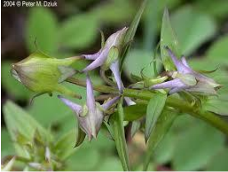
Gentian, Spurred Halenia deflexa