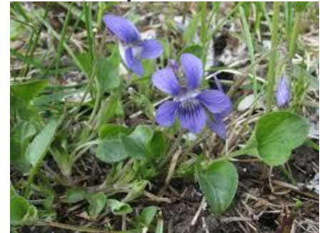
Violet, Early Blue Viola adunca