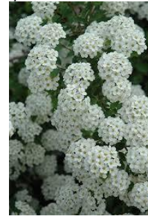
Spirea, Bridal-wreath Spirea x vanhouttei