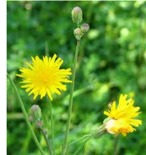
Hawkweed, Canada Hieracium canadense