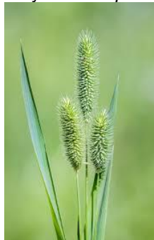
Timothy Phleum pratense