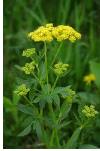
Alexanders, Heart-leaved Zizia aptera