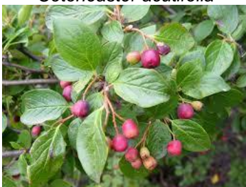
Cotoneaster, Peking Cotoneaster acutifolia