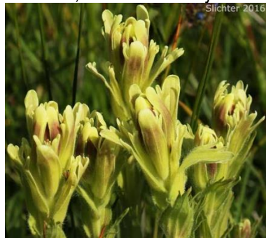
Paintbrush, Yellow Castilleja cusickii