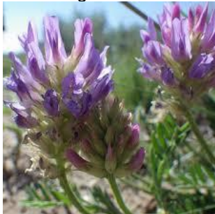
Milk Vetch, Ascending Purple Astragalus striatus