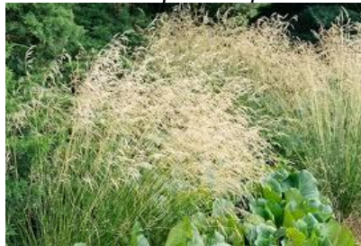
Hairgrass, Tufted Deschampsia cespitosa