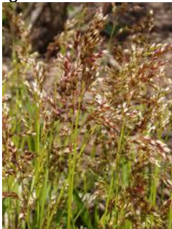
Sweetgrass Hierochloa odorata