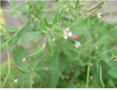
Willow-herb, Purple-leaved Epilobium glandulosum