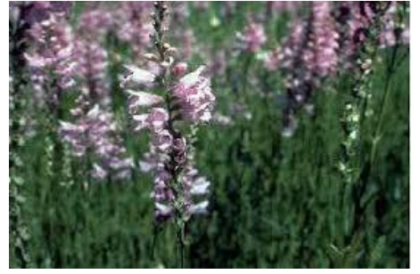
Dragonhead Physostegia parviflora