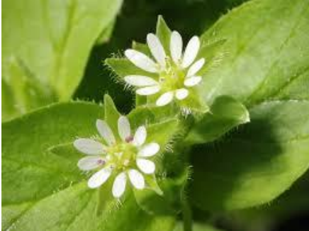
Chickweed, Common Stellaria media