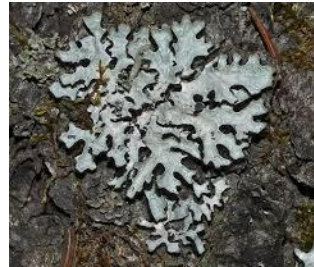
Hammered Shield Lichen Parmelia sulcata