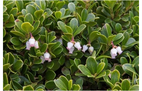
Bearberry, Common/Kinnikinnick Arctostaphylos uva-ursi