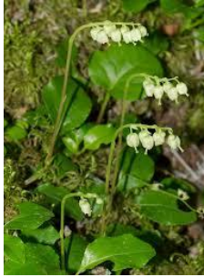
Wintergreen, One-sided Orthilia secunda