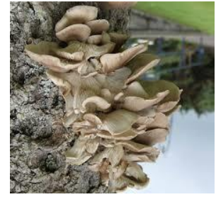
Oyster Mushroom Pleurotus ostreatus