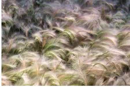
Barley, Foxtail Hordeum jubatum