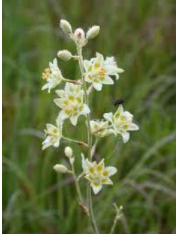
Camas, White Zigadenus elegans