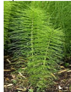
Horsetail, Common Equisetum arvense