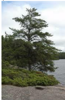
Pine, Jack Pinus banksiana