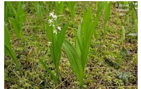
Solomon's Seal, Three-leaved Smilacina trifolia