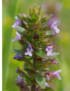
Dragonhead, Thyme-leaved Dracocephalum thymiflorum