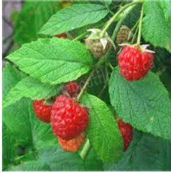
Raspberry, Wild Red Rubus idaeus