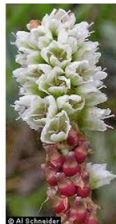
Bistort, Alpine Polygonon viviparum