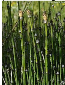
Horsetail, Variegated Equisetum variegatum