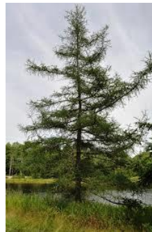
Tamarack/Larch Larix laricina