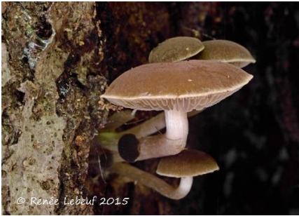
American Simocybe Simocybe serrulatus