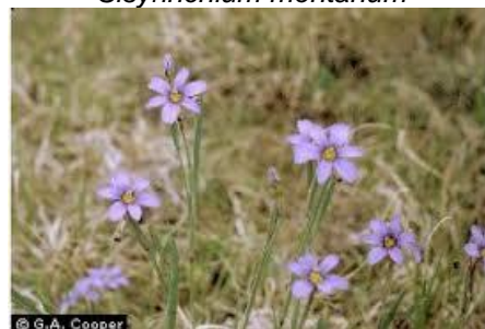
Blue-eyed Grass, Common Sisyrinchium montanum