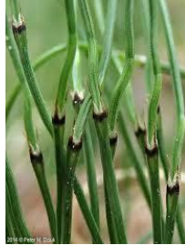
Scouring Rush, Dwarf Equisetum scirpoides