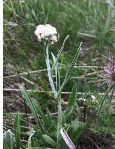
Pussytoes, Showy Antennaria pulcherrima