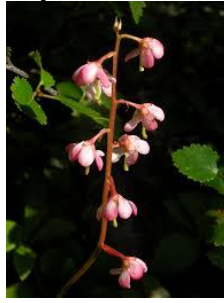
Wintergreen, Common Pink Pyrola asarifolia