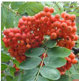
Mountain-Ash, European Sorbus aucuparia