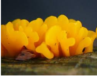
Orange Jelly Fungus Dacrymyces chrysospermus