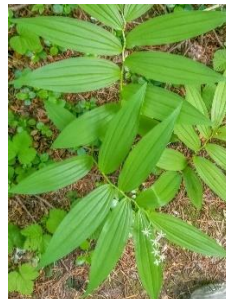
Solomon's Seal, Star-flowered Smilacina stellate