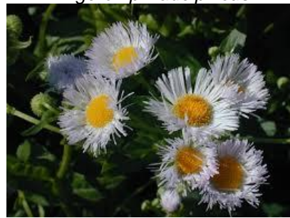
Fleabane, Philadelphia Erigeron philadelphicus