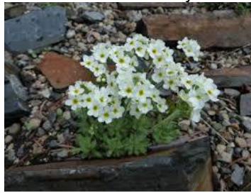
Androsace, Sweet-flower Androsace chamaejasme