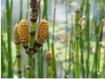
Scouring Rush, Common Equisetum hyemale