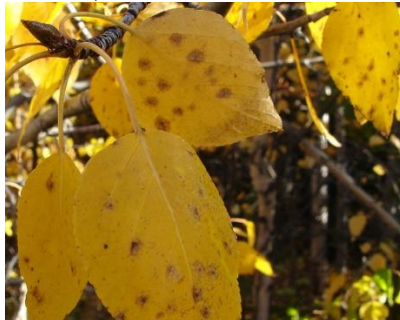
Birch, Alaska Betula neoalaskana