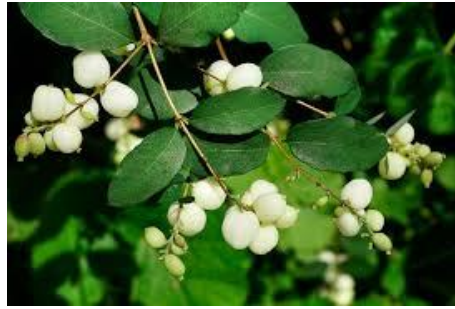
Snowberry Symphoricarpos albus