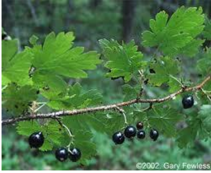
Currant, Bristly Black Ribes lacustre