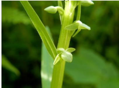
Orchid, Northern Green Bog Platanthera hyperborean