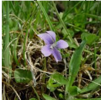
Violet, Bog Viola nephrophylla