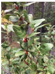
Buffaloberry, Canada Shepherdia canadensis