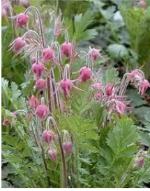
Avens, Three-flowered Geum triflorum