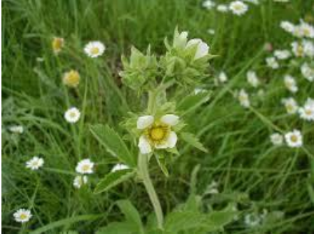
Cinquefoil, White Potentilla arguta