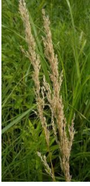
Reedgrass, Bluejoint Calamagrostis canadensis