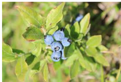
Blueberry, Common Vaccinium myrtilloides