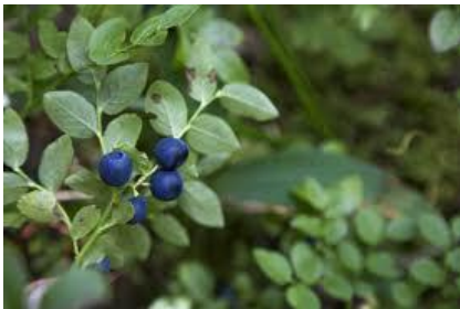
Bilberry, Low Vaccinium myrtillus