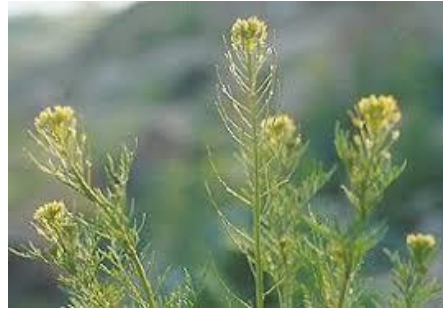
Flixweed Descurainia Sophia