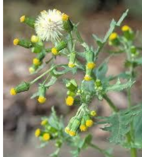
Groundsel, Common Senecio vulgaris