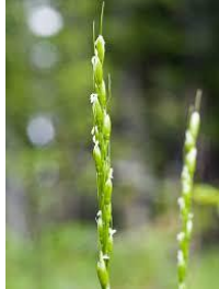
Rice Grass, White-grained Mountain Oryzopsis asperifolia