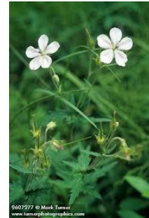
Geranium, Richardson's/Wild White Geranium richardsonii