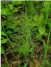
Horsetail, Meadow Equisetum pratense