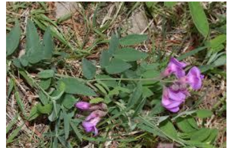
Vetch, Wild Vicia Americana