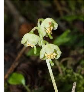
Wintergreen, Greenish-flowered Pyrola chlorantha