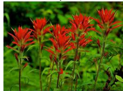
Paintbrush, Common Red Castilleja miniata