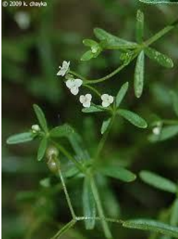
Bedstraw, Small Galium trifidum