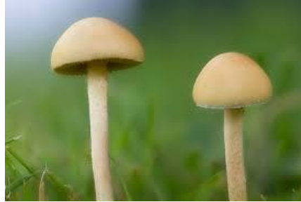
Plains Agrocybe Agrocybe pediades