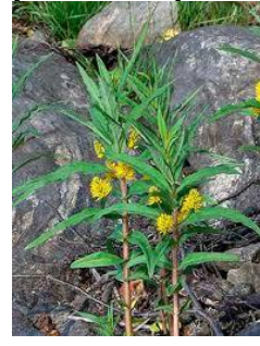
Loosestrife, Tufted Lysimachia thyrsoiflora