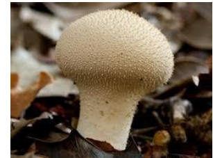
Common Puffball Lycoperdon perlatum