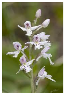
Orchid, Round-leaved Amerorchis rotundifolia