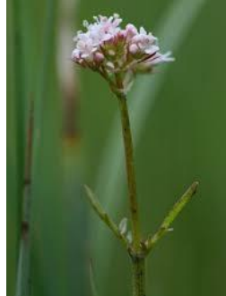
Valerian, Northern Valeriana dioica