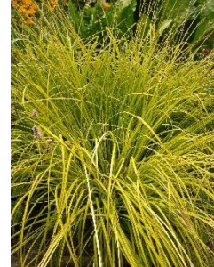
Sedge, Golden Carex aurea