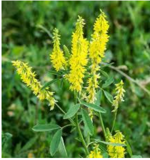
Sweet Clover, Yellow Melilotus officinalis