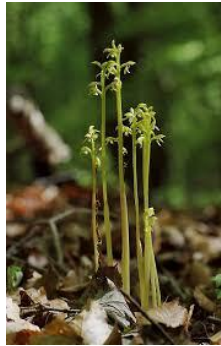
Coralroot, Pale Corallorhiza trifida