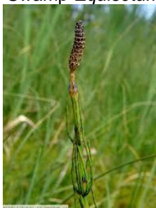
Horsetail, Swamp Equisetum fluviatile