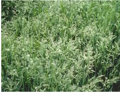
Bluegrass, Kentucky Poa pratensis