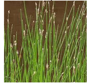
Spike-rush, Creeping Eleocharis palustris