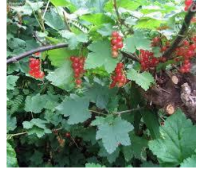
Currant, Wild Red Ribes triste