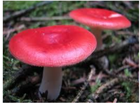
Russula sp. Mushroom Russula sp.