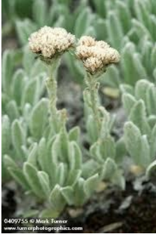
Everlasting, Woolly Antennaria lanata