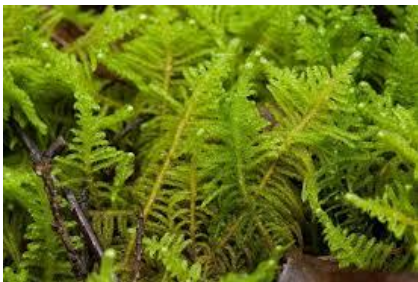
Knight's Plume Moss Ptilium crista-castrensis