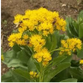
Goldenrod, Stiff Solidago rigida