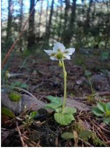
Wintergreen, One-flowered Moneses uniflora