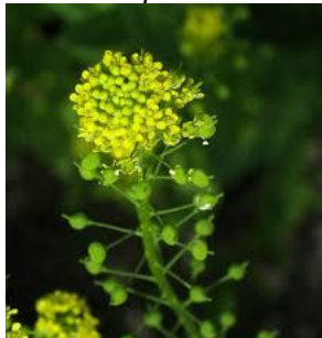
Mustard, Common Ball Neslia paniculate