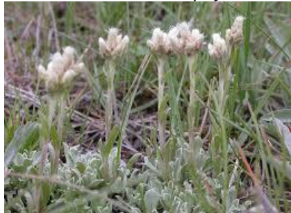
Pussytoes, Littleleaf Antennaria microphylla