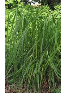
Grass, Orchard Dactylis glomerata