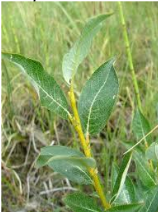
Willow, False-Mountain Salix pseudomonticola