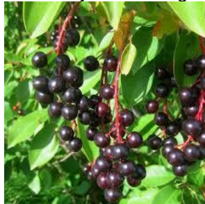
Choke Cherry Prunus virginiana