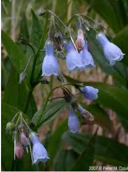
Lungwort, Tall Mertensia paniculate