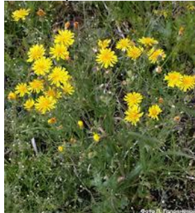
Hawk's-beard, Annual Crepis tectorum