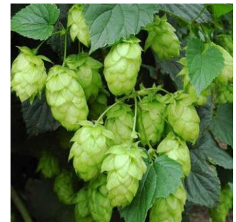
Hops, Common Humulus lupulus