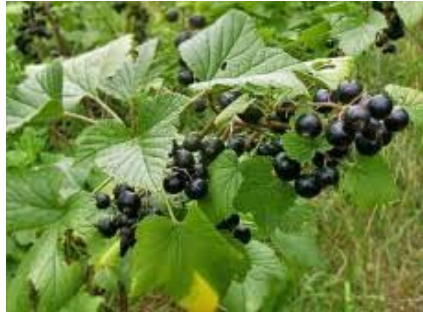
Currant, Wild Black Ribes americanum