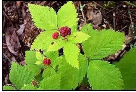
Dewberry Rubus pubescens