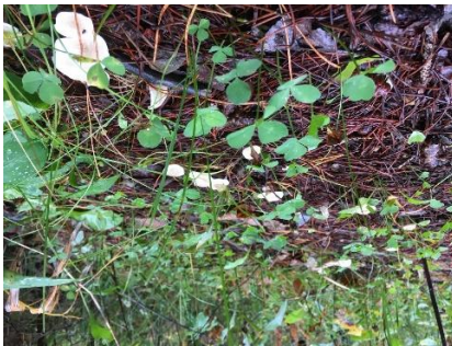
Scented Tricholoma Tricholoma inamoenum