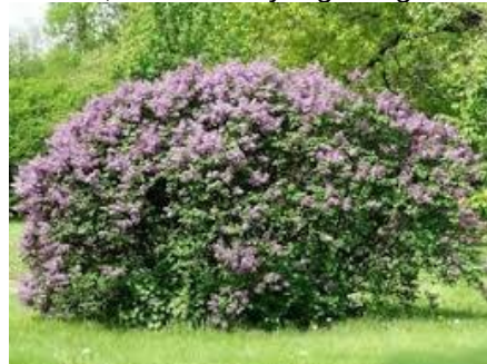
Lilac, Common Syringa vulgaris