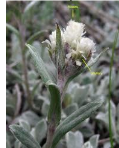
Everlasting, Small-leaved Antennaria parvifolia