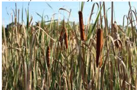
Cattail, Wide-leaved Typha latifolia