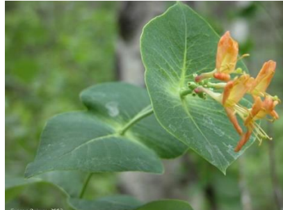
Honeysuckle, Twining Lonicera dioica