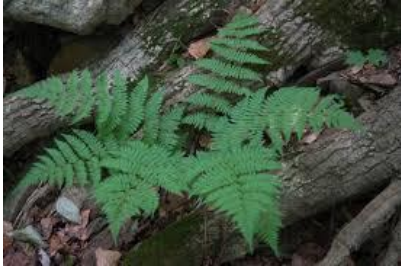
Fern, Narrow Spinulose Shield Dryopteris carthusiana