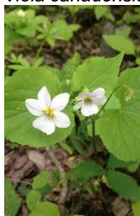
Violet, Western Canada Viola canadensis