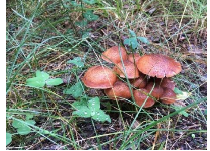
Honey Mushroom Armillaria mellea