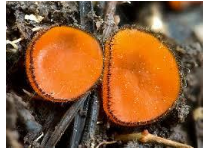
Eyelash Fungus Scutellinia scutellata