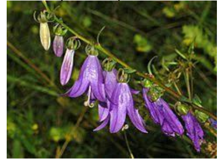
Bellflower, Creeping Campanula rapunculoides