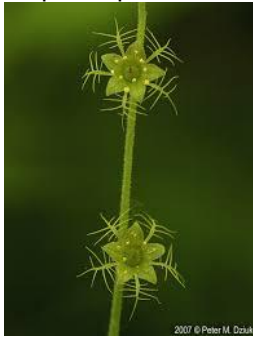
Bishop's Cap Mitella nuda