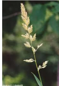
Canary Grass, Reed Phalaris arundinacea