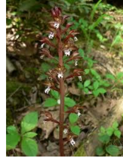
Coralroot, Spotted Corallorhiza maculate