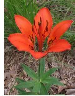
Wood Lily, Western Lilium philadelphicum