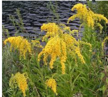
Goldenrod, Late Solidago gigantea