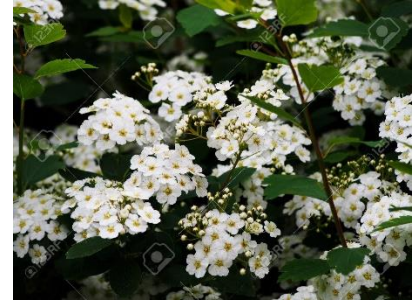
Meadowsweet, White Spiraea betulifolia