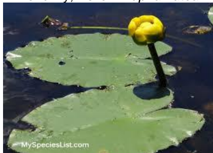
Pond-lily, Yellow Nuphar lutea