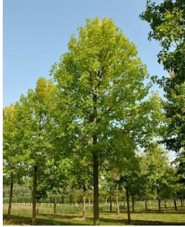
Ash, Green Fraxinus pennsylvanica