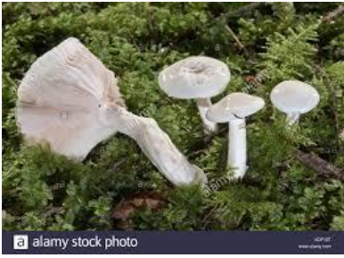
Spruce Waxgill Hygrophorus piceae