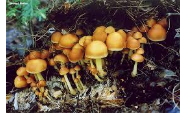
Forest-loving Collybia Gymnopus dryophilus