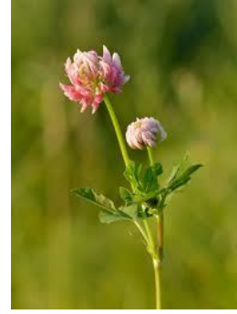
Clover, Alsike Trifolium hybridum