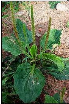
Plantain, Common Plantago major