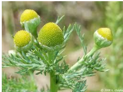
Pineappleweed Matricaria matricarioides