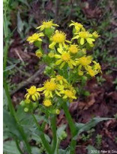
Groundsel, Entire-leaved Senecio integerrimus