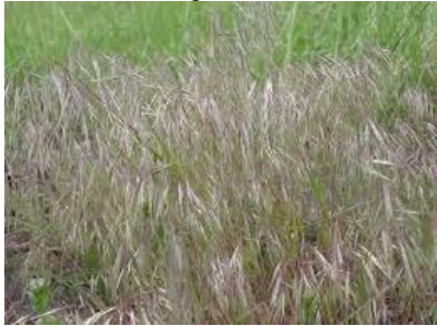
Brome, Nodding Bromus anomalus