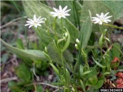
Chickweed, Long-stalked Stellaria longipes