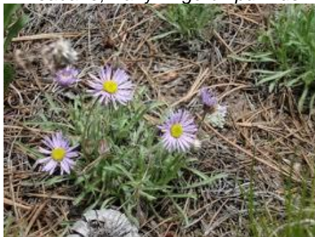
Fleabane, Hairy Erigeron pumilus