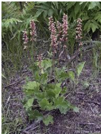
Alumroot, Richardson's Heuchera richardsonii