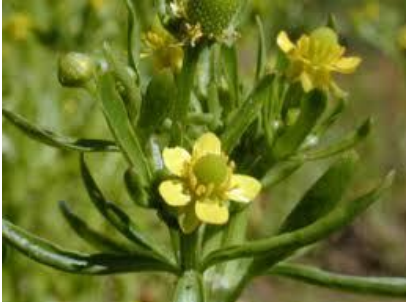
Buttercup, Celery-leaved Ranunculus sceleratus