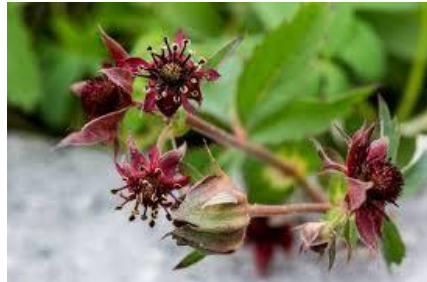
Cinquefoil, Marsh Potentilla palustris