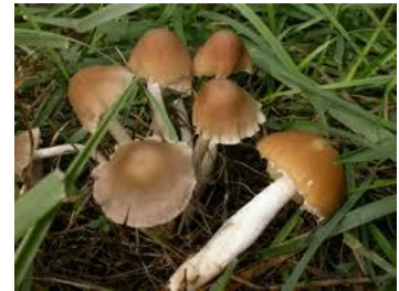
Suburban Psathyrella Psathyrella candolleana