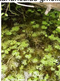
Crowfoot, Yellow Water Ranunculus gmelinii