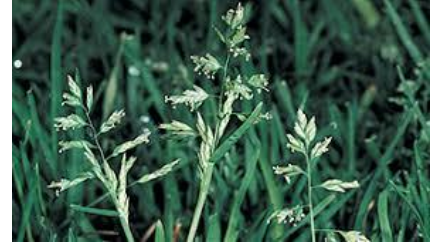
Bluegrass, Annual Poa annua