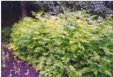
Spirea, False Sorbaria sorbifolia