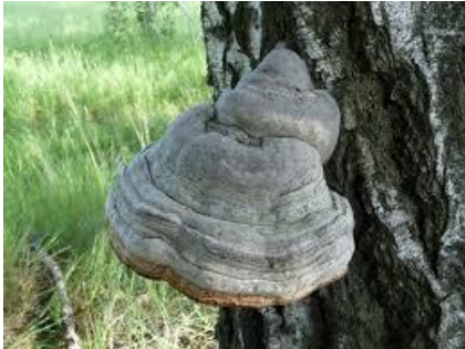
Tinder Conk Fomes fomentarius