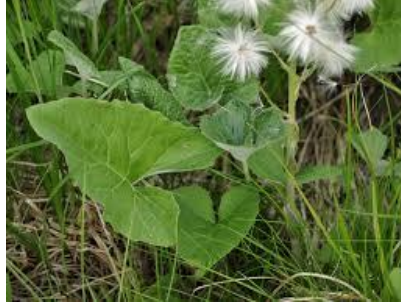
Coltsfoot, Narrow-leaved Petasites sagittatus