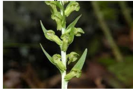
Orchid, Bracted Bog Coeloglossum viride