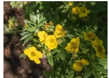
Cinquefoil, Shrubby Potentilla fruticosa