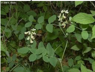
Vetchling, Cream-colored Lathyrus ochroleucus