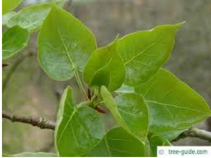
Poplar, Balsam Populus balsamifera