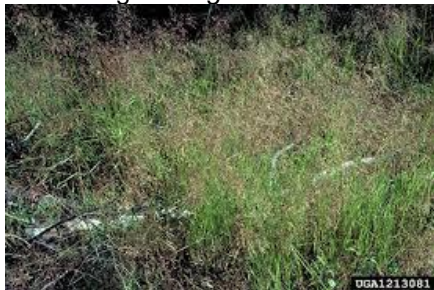
Hairgrass Agrostis scabra