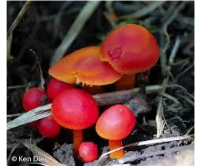
Vermilion Waxgill Hygrocybe miniata