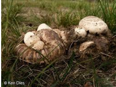
Parasitic Psathyrella Psathyrella epimyces