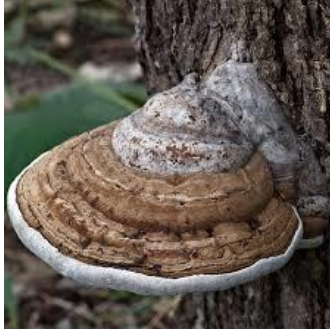
Artist's Conk Ganoderma applanatum