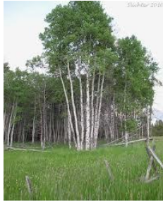
Aspen Populus tremuloides