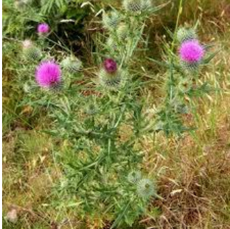
Thistle, Bull Cirsium vulgare