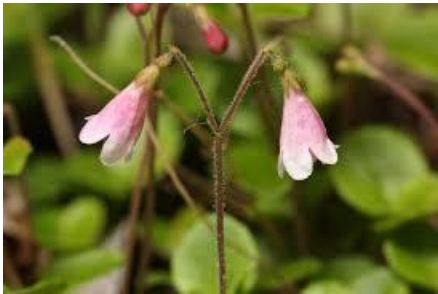
Twinflower Linnaea borealis