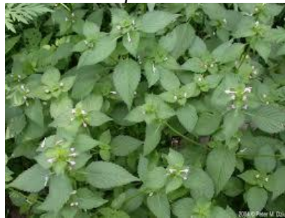
Hempnettle, Brittle-stem Galeopsis tetrahit