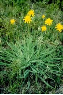
Dandelion, Yellow False Agoseris glauca