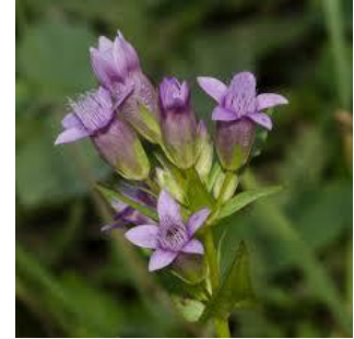
Gentian, Northern Gentianella amarella