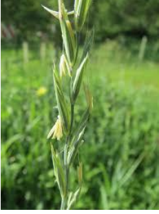
Wheatgrass, Slender Elymus trachycaulus