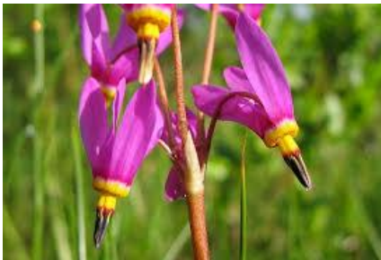
Shooting Star, Saline Dodecatheon pulchellum