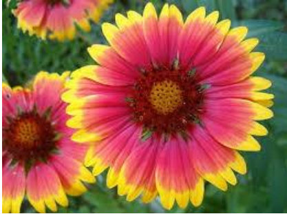
Gaillardia/Brown-eyed Susan Gaillardia aristata