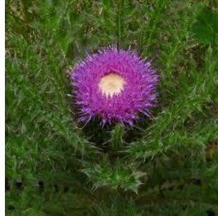
Thistle, Drummond's Cirsium drummondii