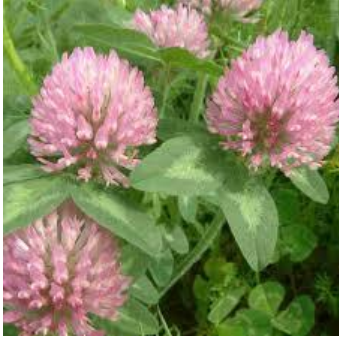
Clover, Red Trifolium pratense