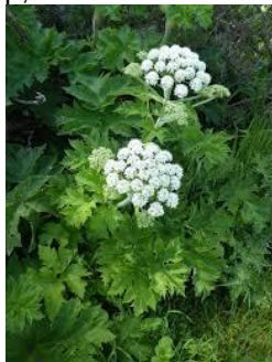
Parsnip, Cow Heracleum lanatum