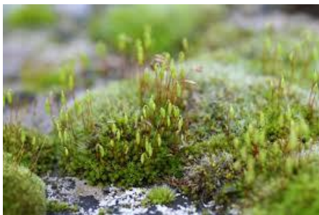
Mnium moss order Bryales