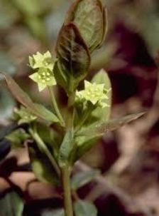
Comandra, Northern/ Toadflax, Northern Bastard Geocaulon lividum