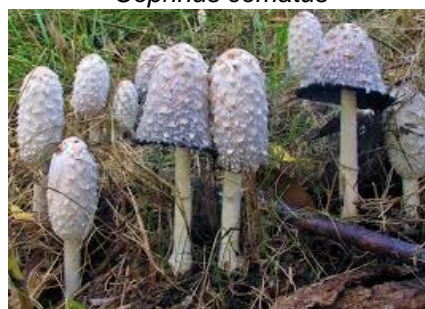
Shaggy Mane mushroom Coprinus comatus