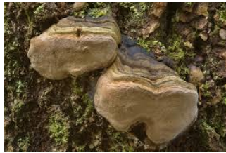
False Tinder Phellinus tremulae