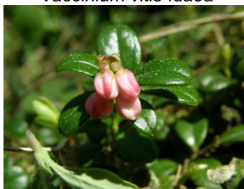
Cranberry, Bog Vaccinium vitis-idaea