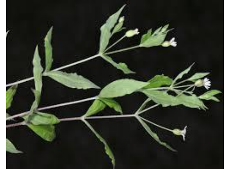
Catchfly, Menzies' Silene menziesii