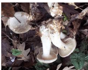
Small Scaly Clitocybe Clitocybe squamulose