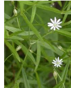
Chickweed, Long-leaved Stellaria longifolia