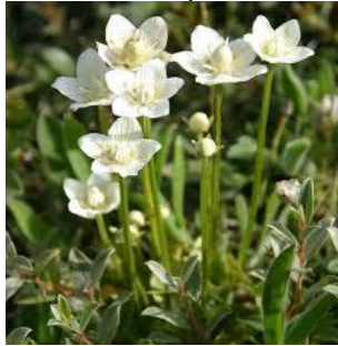
Grass-of-Parnassus, Northern Parnassia palustris