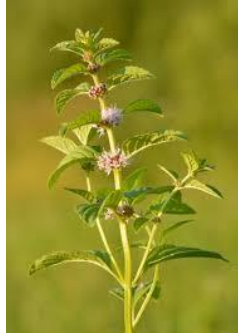
Mint, Wild Mentha arvensis