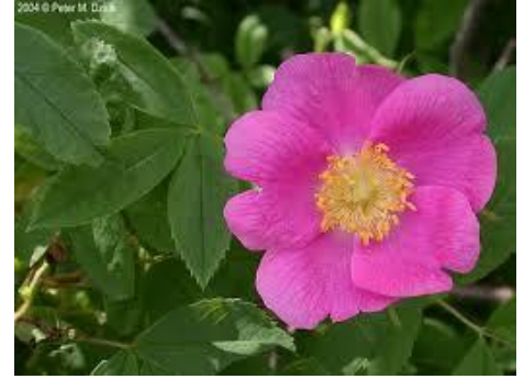
Rose, Prickly Rosa acicularis