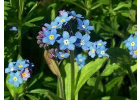
Forget-Me-Not Myosotis sp.