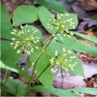
Sarsaparilla, Wild Aralia nudicaulis