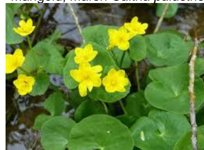
Marigold, Marsh Caltha palustris