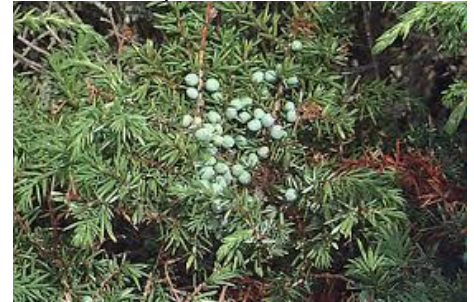
Juniper, Common Juniperus communis