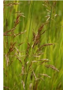
Brome, Awnless Bromus inermis