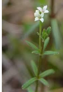
Bedstraw, Labrador Galium labradoricum