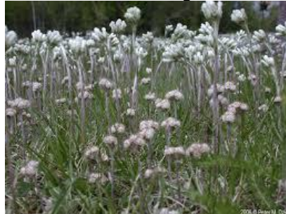
Everlasting, Broad-leaved Antennaria neglecta