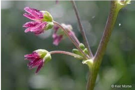
Meadow Rue, Veiny Thalictrum venulosum