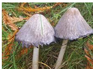
Smooth Inky Cap Coprinopsis atramentarius