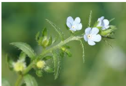
Bluebur Lappula squarrosa