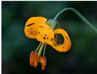
Lily, Western Tiger Lilium columbianum