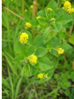
Medick, Black Medicago lupulina