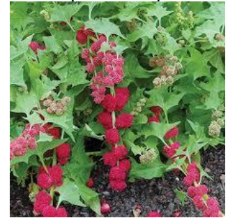
Blite, Strawberry Chenopodium capitatum