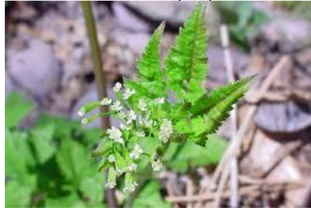
Sweetcicely, Blunt-fruited Osmorhiza depauperate