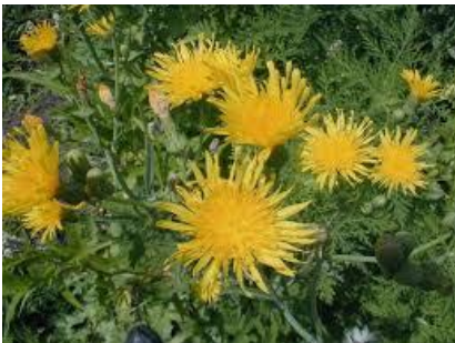
Sow-Thistle, Perennial Sonchus arvensis