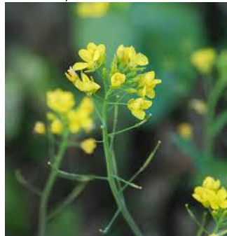
Mustard, Wild Brassica kaber