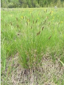
Sedge, Bulrush Carex scirpoidea