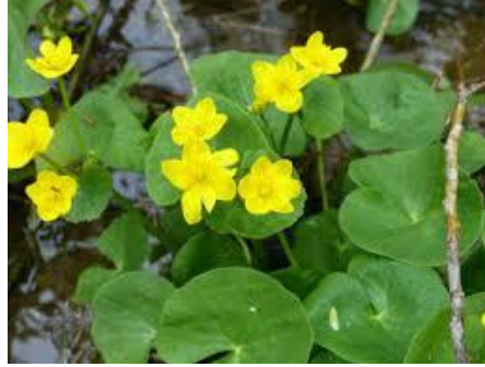
Marigold, Marsh Caltha palustris