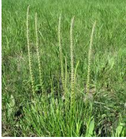
Arrow-grass, Seaside Triglochin maritima