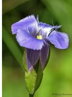
Gentian, Fringed Gentianella crinite