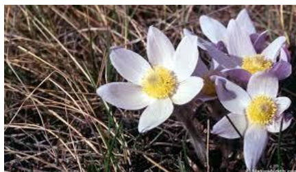
Crocus, Prairie Anemone patens