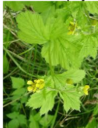
Avens, Large-leaved Yellow Geum macrophyllum