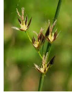
Rush, Wire Juncus balticus