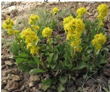
Goldenrod, Dwarf/Mountain Solidago spathulate