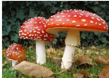
Fly Amanita Amanita muscaria