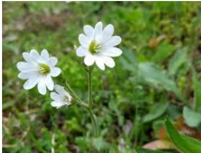
Chickweed, Field Mouse-eared Cerastium arvense