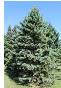
Spruce, White Picea glauca