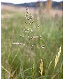
Bluegrass, Canada Poa compressa