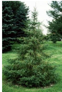
Spruce, Black Picea mariana