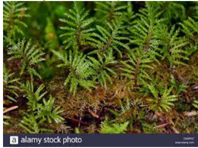
Stairstep Moss Hylocomium splendens