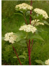
Dogwood, Red-Osier Cornus stolonifera