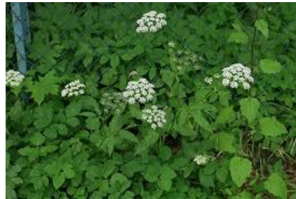
Goutweed, Bishop's Aegopodium podagraria