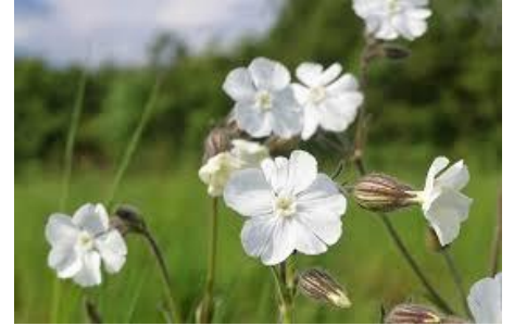
Cockle, White Silene latifolia