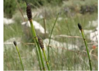
Scouring Rush, Smooth Equisetum laevigatum