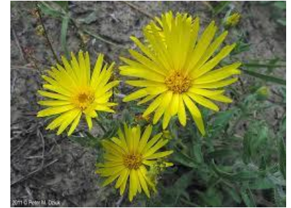
Aster, Golden Heterotheca villosa