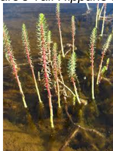
Mare's Tail Hippuris sp.