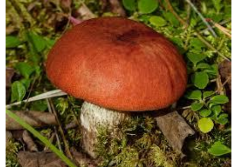
Aspen Rough Stem Leccinum insigne