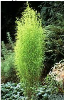
Summer-Cypress Bassia scoparia