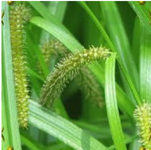
Sedge, Small Bottle Carex utriculata