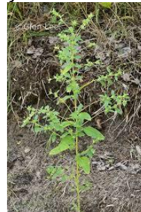
Pigweed, Russian Axyris amaranthoides