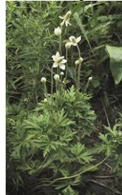
Anemone, Long-fruited Anemone cylindrica