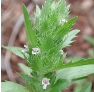
Dragonhead, American Dracocephalum parviflorum