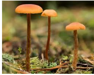
Orange Laccaria Laccaria laccata