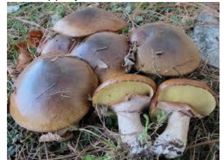
Slippery Jack Suillus luteus