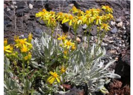
Groundsel, Prairie Senecio canus