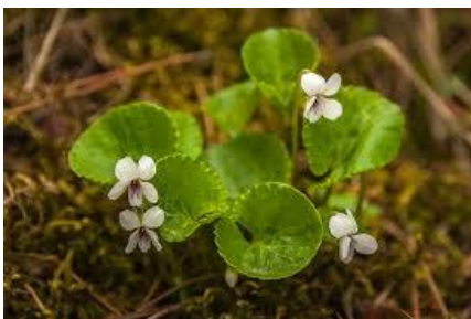
Violet, Kidney-leaved Viola renifolia