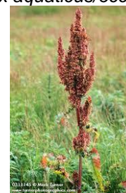
Dock, Western Rumex aquaticus/occidentalis