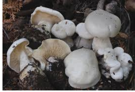
Strong Clitocybe Clitocybe robusta