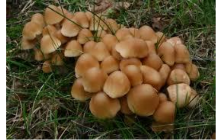
Psathyrella sp. Psathyrella sp.