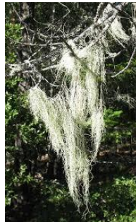
Old Man's Beard Usnea