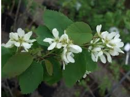
Saskatoon Amelanchier alnifolia