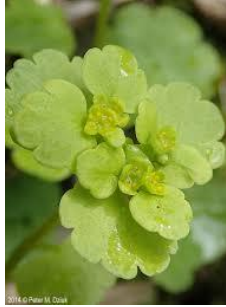
Saxifrage, Golden Chrysosplenium iowense