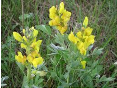
Bean, Golden/Buffalo Thermopsis rhombifolia