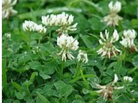
Clover, White Trifolium repens