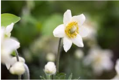
Anemone, Cut-leaved Anemone multifida