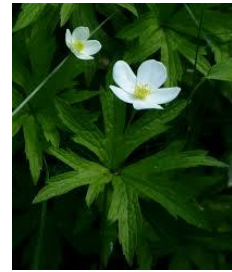
Anemone, Canada Anemone canadensis