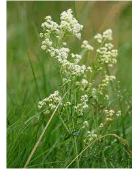
Bedstraw, Northern Galium boreale