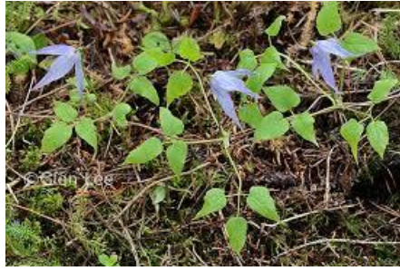
Clematis, Purple Clematis occidentalis