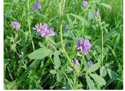
Alfalfa Medicago sativa