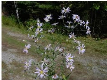
Aster, Lindley's Symphotrichum ciliolatus