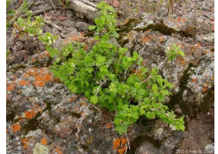
Gooseberry, Northern Ribes oxycanthoides