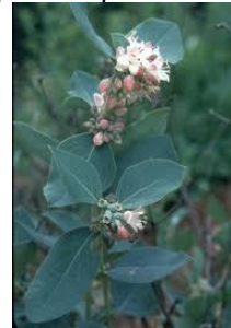
Buckbrush/Wolfberry Symphoricarpos occidentalis