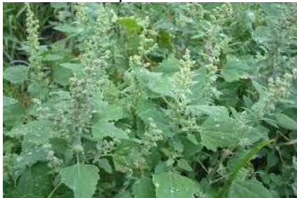
Lamb's Quarters Chenopodium album