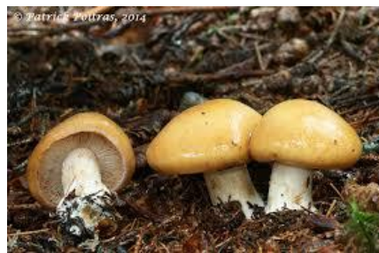
Variable Cortinarius Cortinarius multififormis