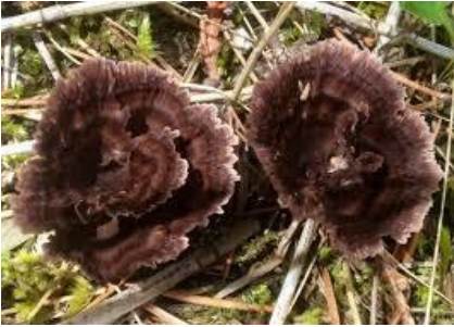
Earthfan Fungus Thelephora terrestris