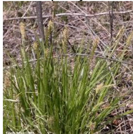
Sedge, Sun-loving Carex pensylvanica