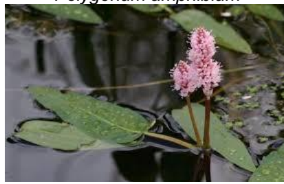
Smartweed, Water Polygonum amphibium