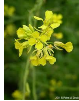
Mustard, Black Brassica nigra