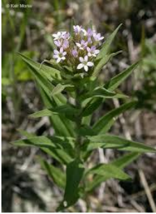
Collomia, Narrow-leaved Collomia linearis