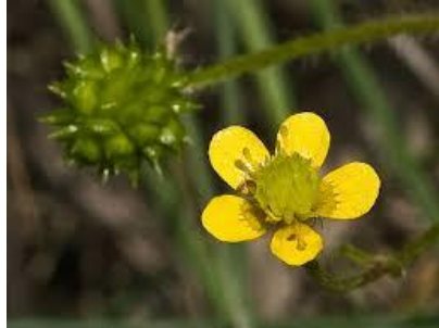
Buttercup, Macoun's Ranunculus macounii