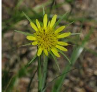
Goat's-beard, Common Tragopogon dubius