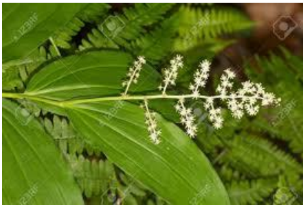
Solomon's Seal, False Smilacina racemose