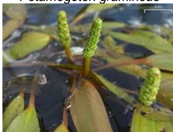
Pondweed, Floating-leaved Potamogeton gramineus