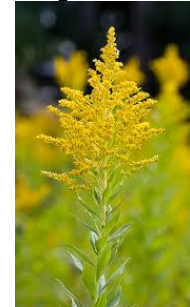
Goldenrod, Canada Solidago canadensis