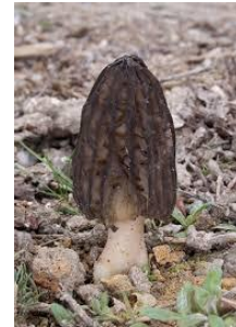
Morel mushroom Morchella elata