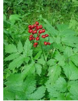
Baneberry, Red Actaea rubra