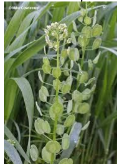
Stinkweed Thlaspi arvense