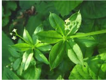
Bedstraw, Sweet-scented Galium triflorum