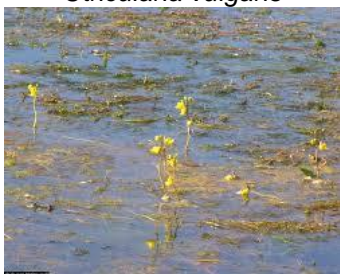
Bladderwort, Common Utricularia vulgaris