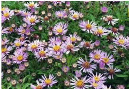
Aster Aster sibiricus