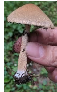
Stiff-legged Psathyrella Psathyrella rigidipes