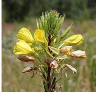
Evening-primrose, Yellow Oenothera biennis