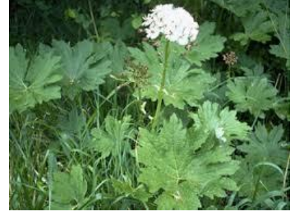
Coltsfoot, Palmate-leaved Petasites frigidus var. palmatus