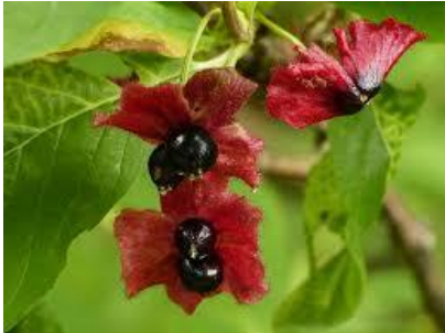
Honeysuckle, Bracted Lonicera involucrata