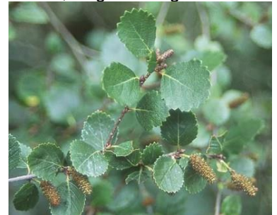
Birch, Bog Betula glandulosa