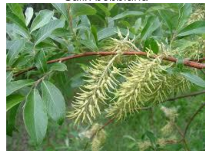
Willow, Bebb's/Beaked Salix bebbiana