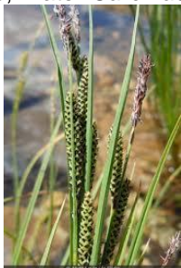
Sedge, Water Carex aquatilis