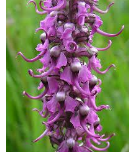
Elephant's-head Pedicularis groenlandica