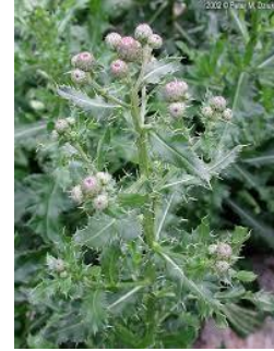
Thistle, Canada Cirsium arvense