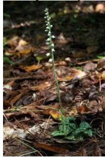
Rattlesnake-Plantain, Northern Goodyera repens