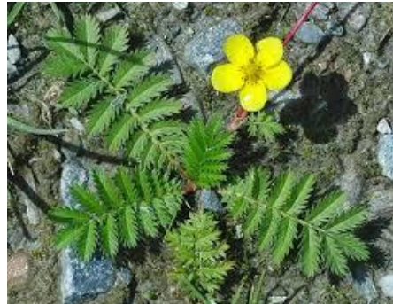
Silverweed Potentilla anserine