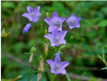
Harebell Campanula rotundifolia