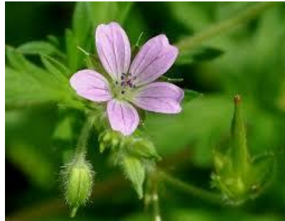
Geranium, Bicknell's Geranium bicknellii