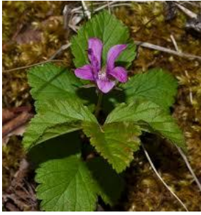
Raspberry, Dwarf/Arctic Rubus arcticus