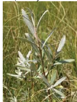
Willow, Hoary Salix candida