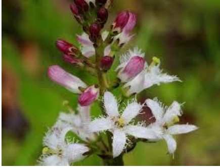
Buck-bean Menyanthes trifoliata