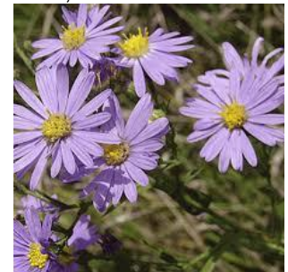
Aster, Smooth Aster laevis