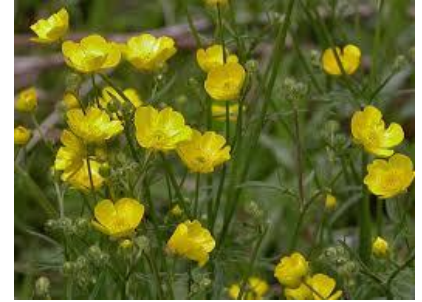
Buttercup, Tall/Common Ranunculus acris