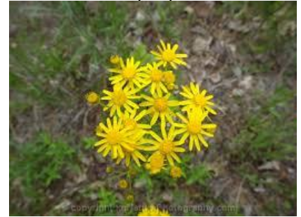
Groundsel, Balsam Senecio pauperculus