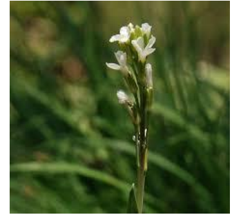
Rock Cress, Drummond's Arabis drummondii