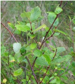
Birch, Dwarf Betula pumila