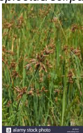
Bulrush, Great Schoenoplectus/scirpus acutus