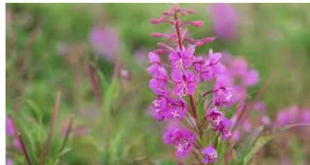
Fireweed, Common Epilobium angustifolium