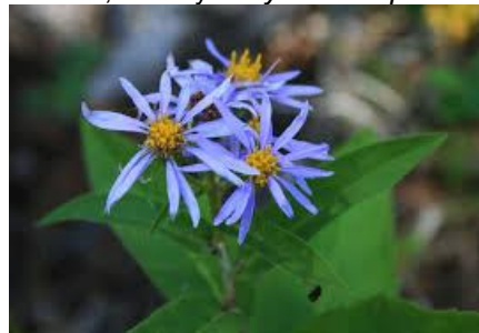
Aster, Showy Eurybia conspicua