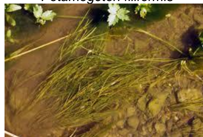
Pondweed, Slender Potamogeton filiformis