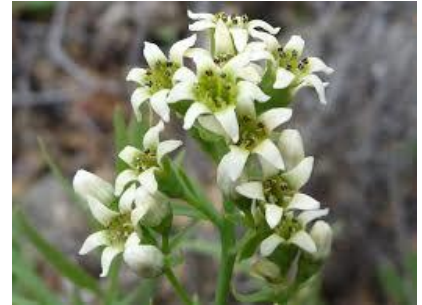
Toadflax, Bastard/Comandra, Pale Comandra umbellate