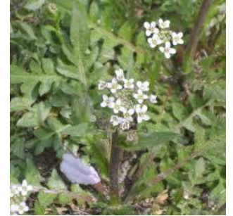
Shepherd's Purse Capsella bursa-pastoris