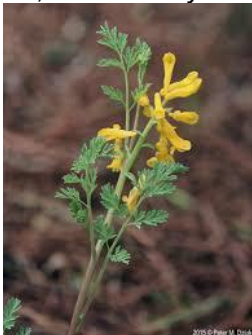
Corydalis, Golden Corydalis aurea