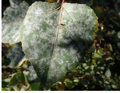
Erysiphe adunca on poplar leaf