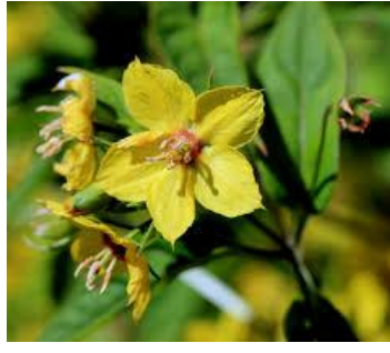
Loosestrife, Fringed Lysimachia ciliata