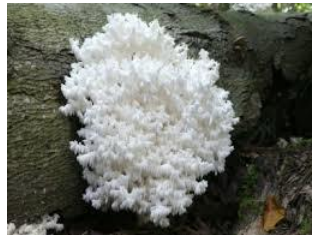
Comb Tooth Fungus Herichium coralloides