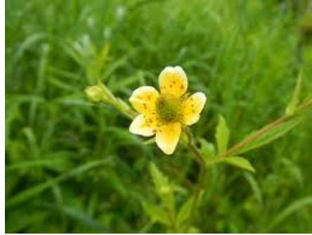
Avens, Yellow Geum aleppicum