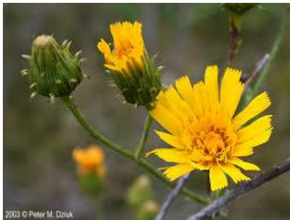
Hawkweed, Narrow-leaved Hieracium umbellatum