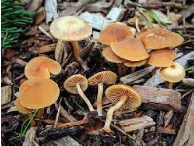
Fringed Tubaria Tubaria furfuracea