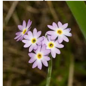
Primrose, Mealy Primula incana