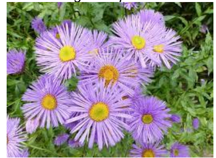
Fleabane, Aspen/Showy Erigeron speciose