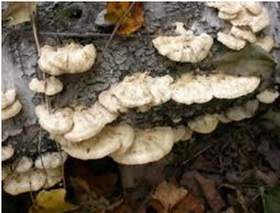
Pubescent Trametes Trametes pubescens