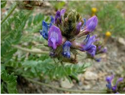
Locoweed, Reflexed Oxytropis deflexa