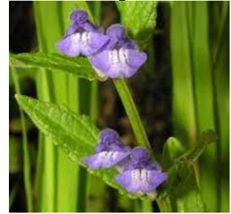
Skullcap, Marsh Scutellaria galericulata