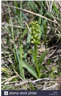
Orchid, Bracted Habenaria viridis