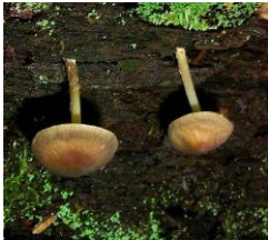
Big-spored Psathyrella Psathyrella megaspora